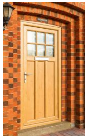
Lincoln (Feature bar)