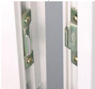
Security claw locks