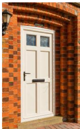
Croxby (Glazed top)