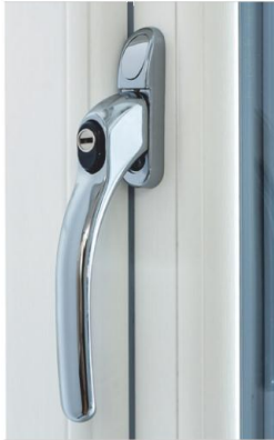
Inline and Offset

✦ The looks of the StyleLine system are complemented by the style and colours of handles that are available for the range.