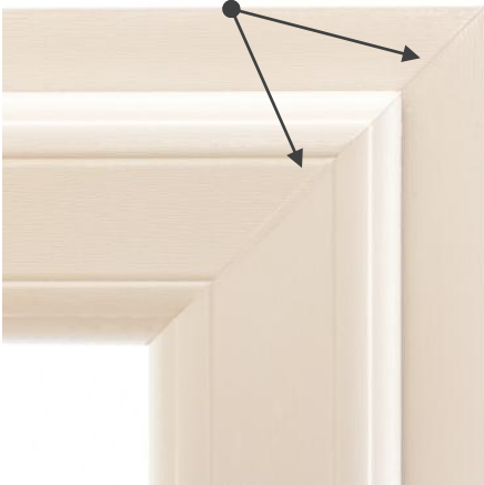
External View of cream laminated window with smooth, seamless welds