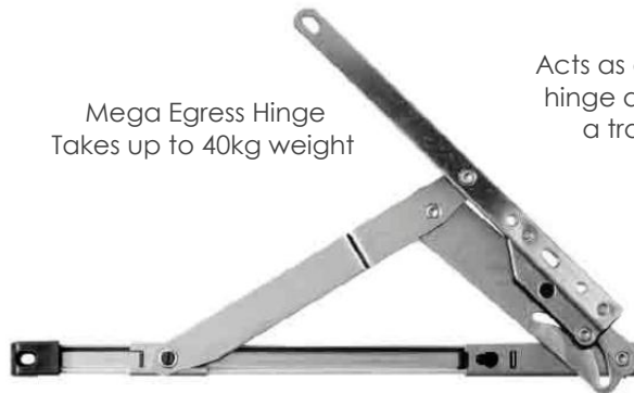
Mega Egress Hinge Takes up to 40kg weight