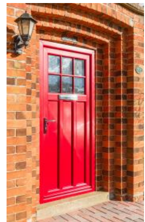
Lincoln (Feature bar)