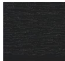
No 10 Black